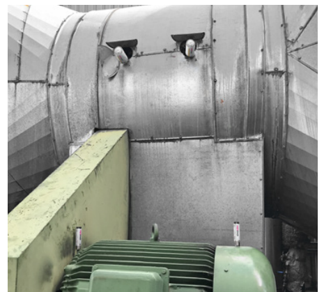
Lubrication of the bearings of a ventilation unit with 125 ml and 15 ml simalube units.