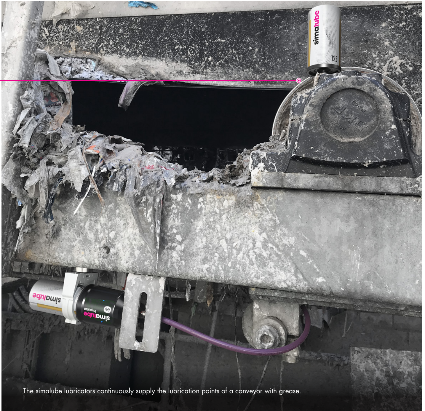
The simalube lubricators continuously supply the lubrication points of a conveyor with grease.