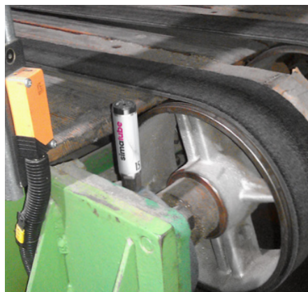
The bearings of the transport belts in a corrugated cardboard factory are continuously lubricated with the simalube lubricator.