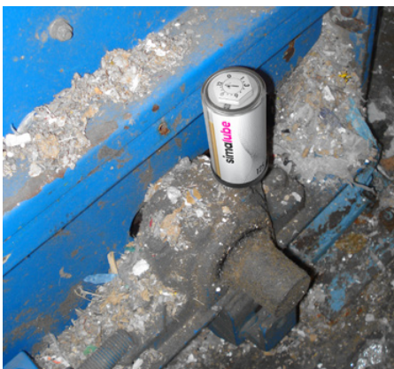
In a paper factory the pedestal bearings of a shredder are lubricated with a 125 ml simalube unit.

«Considerable savings of time and greater safety at work thanks to automatic lubrication»