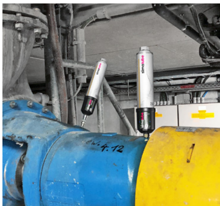
The bearings of the pump are lubricated with two IMPULSE and 250 ml simalube units.