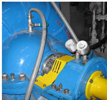
Two 30 ml simalube units lubricate the bearings of a pump.