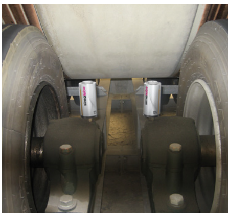
The lubricators are connected directly to the vertical bearing on the drive of a conveyor belt.