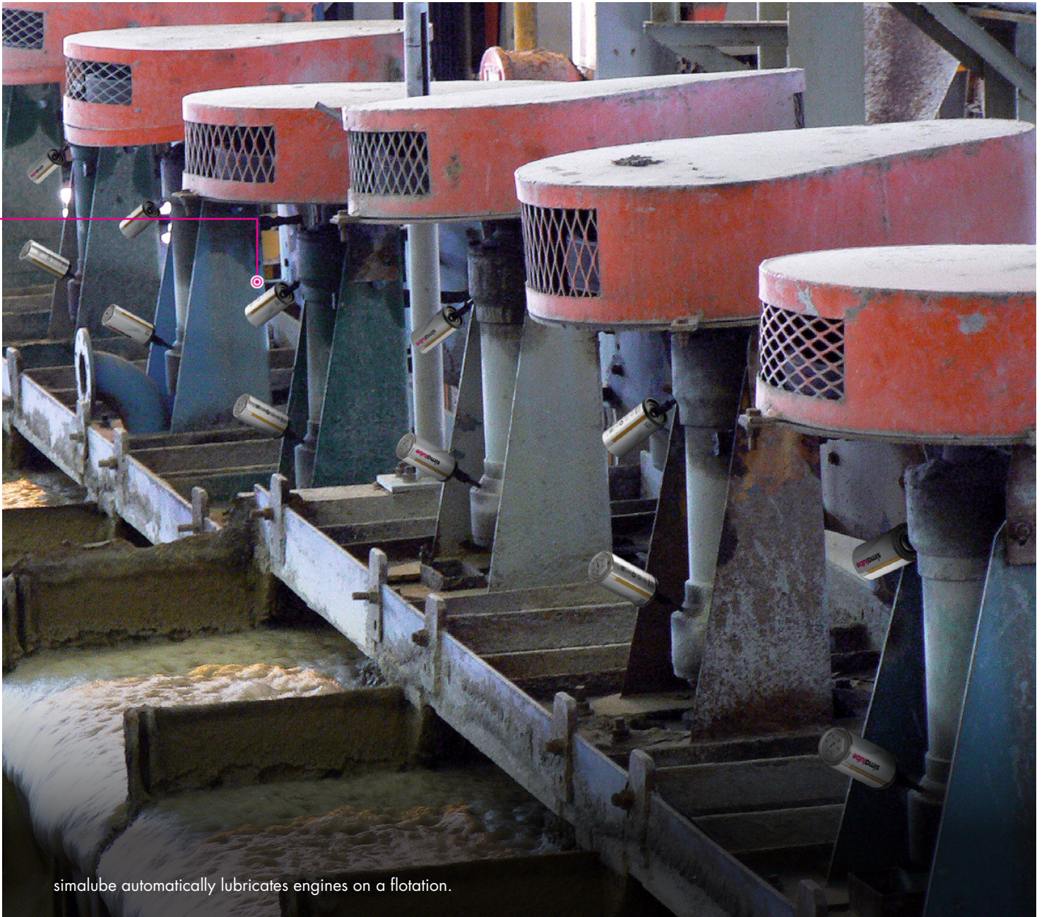
simalube automatically lubricates engines on a flotation.