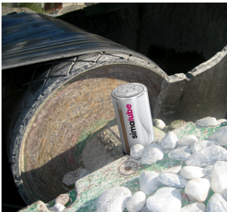
Belt drive lubricated with simalube.

«simalube reduces costs and increases safety in the workplace»