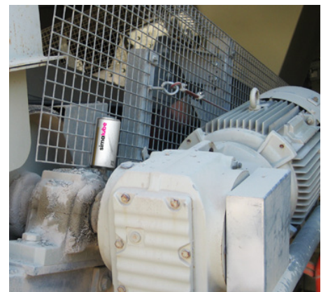
A vertical bearing on a conveyor belt is lubricated with a simalube lubricator.