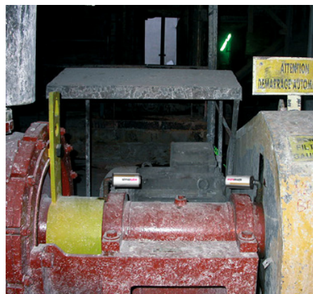
Permanent bearing lubrication on the main drive shaft of a filter pump.