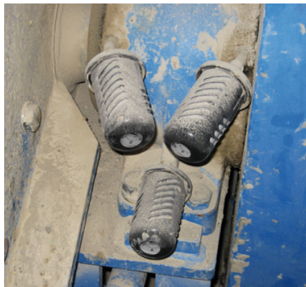
Protective caps used to prevent damage to the lubricator from harsh external conditions.